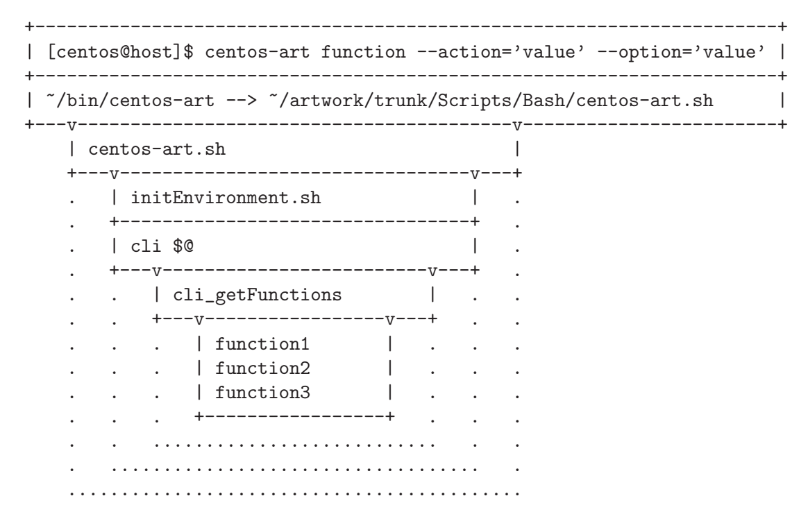
Figure 2.1: The functionalities initialization environment.

Functionalities are implemented by means of actions. Once the functionality has been initiazalized, actions initialization take place for that functionality. Actions initialization model is very similar to functions initialization model. But with the difference, that actions are loaded inside function environment, and so, share variables and functions defined inside function environment.