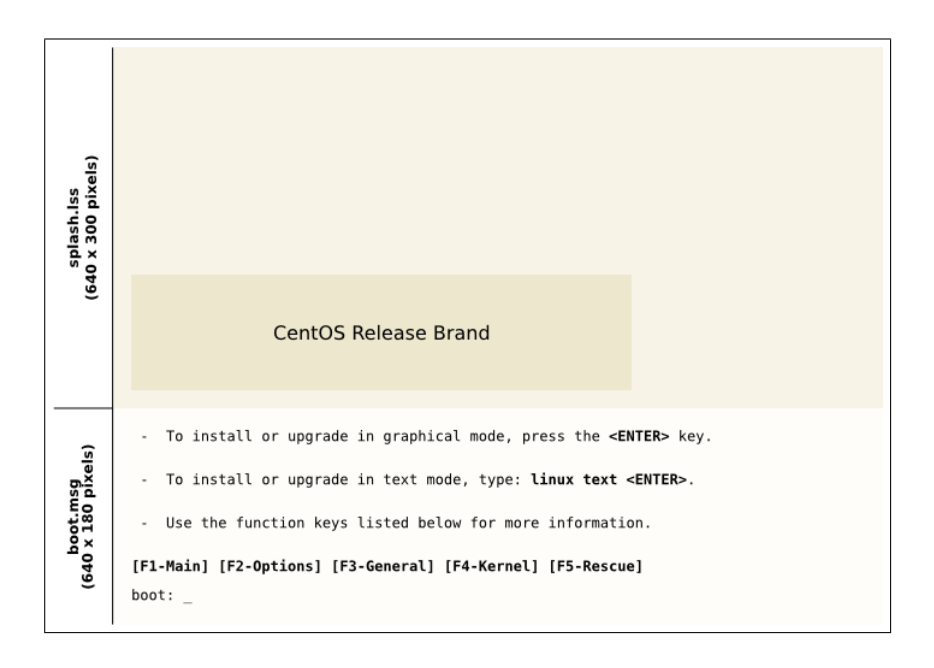
Figure 2: Anaconda Prompt design model.