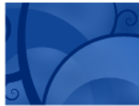
Anaconda background image (800x600.png) holding CentOS Default Artistic Motif.