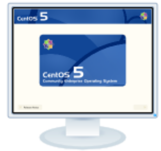
Final design used as based to produce PNG images.