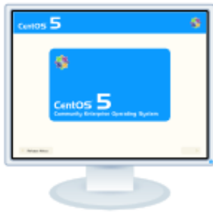
Design Templates (800x600 pixels)