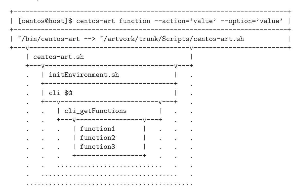
Figure 2.1: The functionalities initialization environment.

Once command-line arguments have been retrived, the 'centos-art.sh' script loads specific functionalities using the 'cli_getFunctions.sh' function script. Only one specific functionality can be loaded at one script execution I.e., you run centos-art.sh script to run just one functionality.