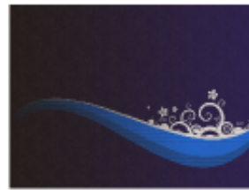
Anaconda background image (800x600.png) holding CentOS Default Artistic Motif.