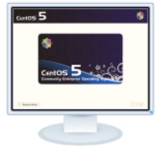
Final design used as based to produce PNG images.