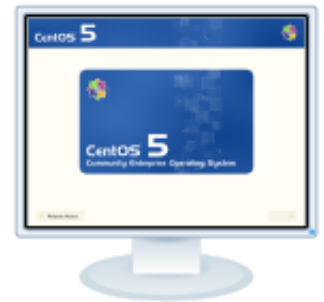
Final design used as based to produce PNG images.