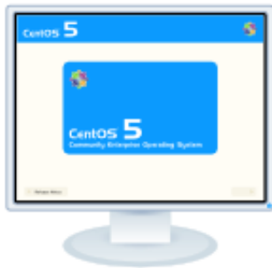
Design Templates (800x600 pixels)