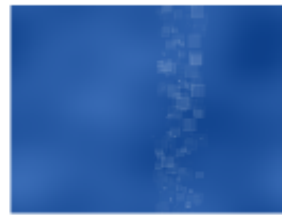
Anaconda background image (800x600-anaconda.png) holding CentOS Default Artistic Motif.