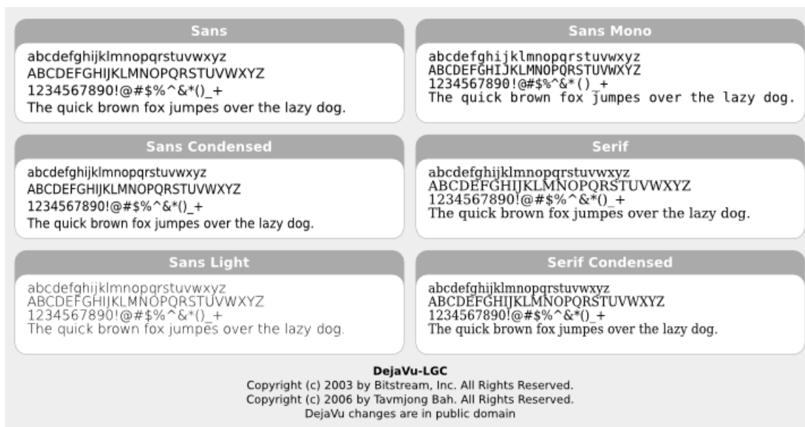
Figure 2.5: DejaVu-LGC font-family.

The CentOS Project Corporate Identity is attached to ‘DejaVu LGC’ font-family and ‘Denmark’ font-family.